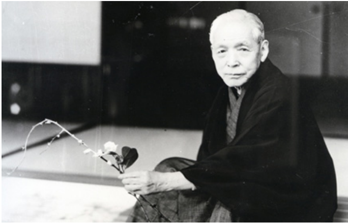
Ichizō Kobayashi, Father of the Takarazuka Revue

The Takarazuka Revue's motto, “Modesty, Fairness, Grace” comes from the teachings of Kobayashi Ichizō. These three ideals serve as the main pillars for every show put on by Takarazuka even in our present time. Kobayashi’s goal with the revue company was to offer “popular theatrical entertainment that the whole family can enjoy together.” Kobayashi's last words referred to the fundamentals of performing arts: singing, dancing and acting that weave beautiful fantasies on stage. His words were also meant as an instruction for each Takarasienne to have proper etiquette, good manners, and not to forget their dignity as individual women and members of society. Although the world has changed a lot since the founder left these instructions behind, the spirit of these words is still deeply ingrained in every Takarasienne and staff member as they navigate their everyday lives.