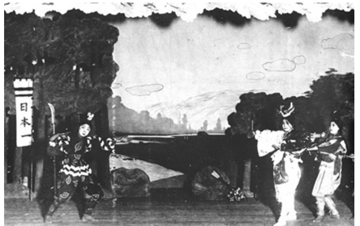
A stage photo from the opera "Dom-Brako"